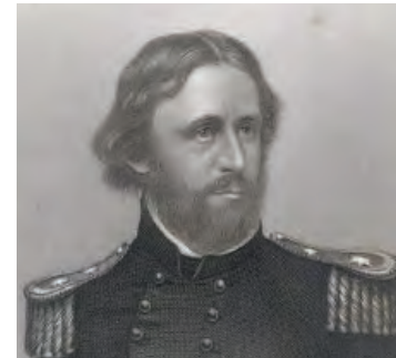
John C. Fremont

route to Sutter's Fort in the California gold country. Following an old Native American trade trail, Fremont's party including 67 horses and mules first sighted Lake Tahoe on February 14, 1844 from the top of what is believed to be the nearby 10,067 foot Red Lake Peak.