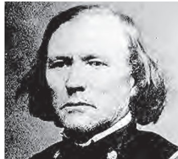
Christopher Houston "Kit" Carson

Like the Washo before them, explorers, trappers and the early gold-seeking emigrants of the 1800's would find the barren mountaintops and ridges as the easiest of passable routes through the mountains during the snow months. These high altitude routes were favored for travel because their exposure to the wind would scour away the deep, impassable snow pack.