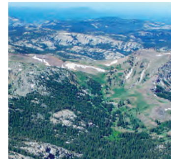
Covered Wagon Peak at Kirkwood

Thimble Peak, following approximately the same route as Kirkwood's Sunrise Chair #4. To this day, rust marks from the iron wagon wheels can be seen on the granite rocks along the route. Some scars on the trees made from the ropes and pulleys used to haul the heavy wagons up over the rugged terrain still remain. The trail continues around Emigrant Lake, located just south of Kirkwood's Iron Horse Chair #3, and then easterly along the south side of Caples Lake and up and over Carson Pass.